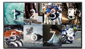
MODE 7: 8 Averaged HDMI input segments.