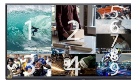
MODE 8: 2 Large, 2 medium, and 8 small HDMI input segments.