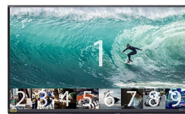
MODE 6: 1 Large and 8 small HDMI input segments.